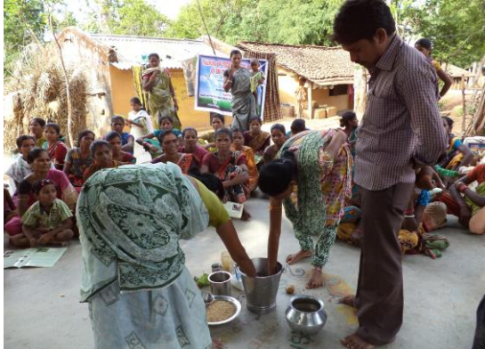
Plant Protection on SRI