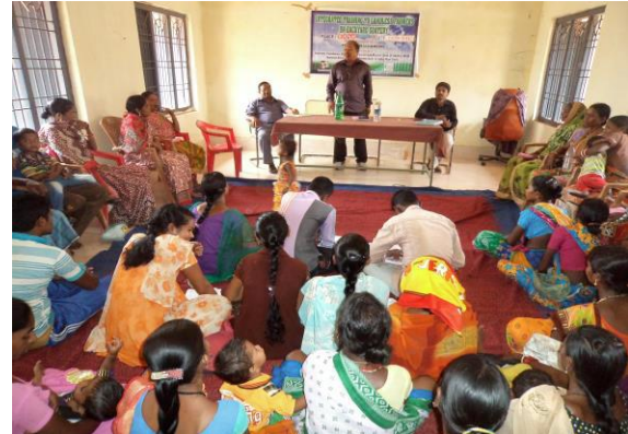
Goat rearing training